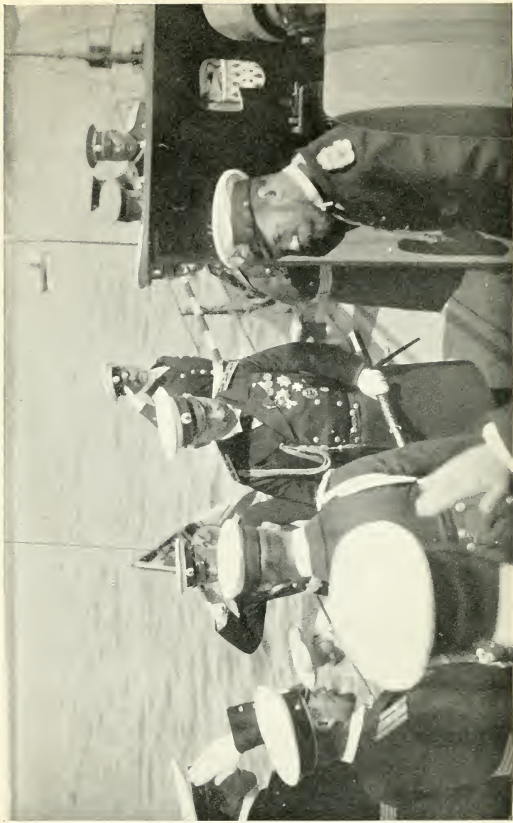
1909—THE EMPEROR WILLIAM IN THE FINNISH FJORDS. The two Emperors on board a motor-boat.